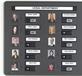
Photo IN/OUT Boards